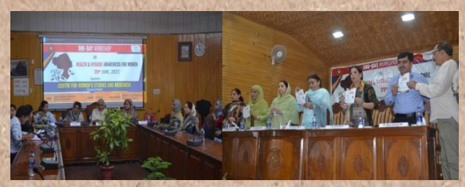
NEWS, EVENTS, SEMINARS AND WEBINARS

One day workshop on "Health and Hygiene Awareness for women" on 29th june 2022.