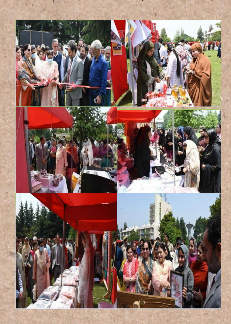
CELEBRATIONS OF INTERNATIONAL WOMEN'S DAY

The centre organized one day exhibition cum sale on May 29, 2023 for women entrepreneurs and saw participation of 45 young entrepreneurs from Kashmir who have set up their business ventures to become economically self-reliant.