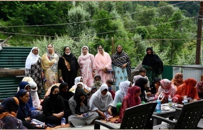
Awareness cum Medical Camp at Gulati Bagh, Warpash (District Ganderbal) on 1st March, 2022.