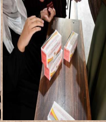
One day awareness programme of health and hygiene of rural women at Fakir Gujri, Dara District Srinagar on 22<sup>nd</sup> July2022.