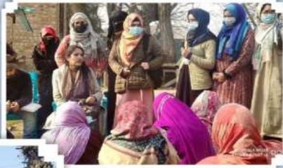
CWSR team interacting with Leper patient at the Leper Colony, Bahrar, Lal Bazar, Srinagar