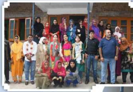
CWSR Team and the local beneficiaries together after the establishment of a Skill Development Centre in Nargistan Tral (District Pulwama).