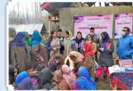
CWSR team including both the faculty members as well as the Ground Volunteers interacting with the local population in Nargistaan Dedarpora, Tral (District Pulwama).