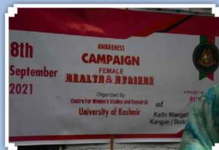
CWSR team in action during an awareness camp on "Female Health and Hygiene" at Kathi Wangath, Baba Nagri, Kangan (District Ganderbal).