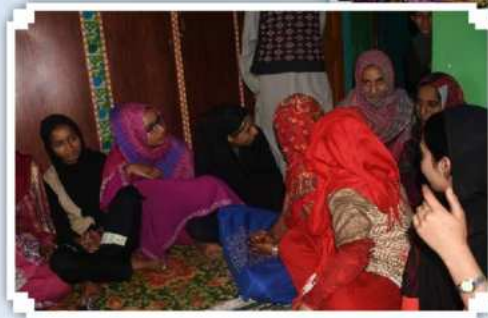
Local Beneficiaries in action at a newly established Skill Development Centre, Nargistan Tral.