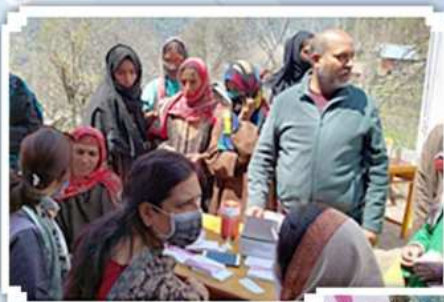
CWSR team including both the faculty members as well as the Ground Volunteers interacting with the local population in Soulnad, Aripal, Tral (District Pulwama).